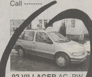
92 VILLAGER AC, PW, Leather seats, AM/FM cassette stereo. 1.000 Call

1980 VOLVO 240DL, Many new parts, Great car for a little money. $700.