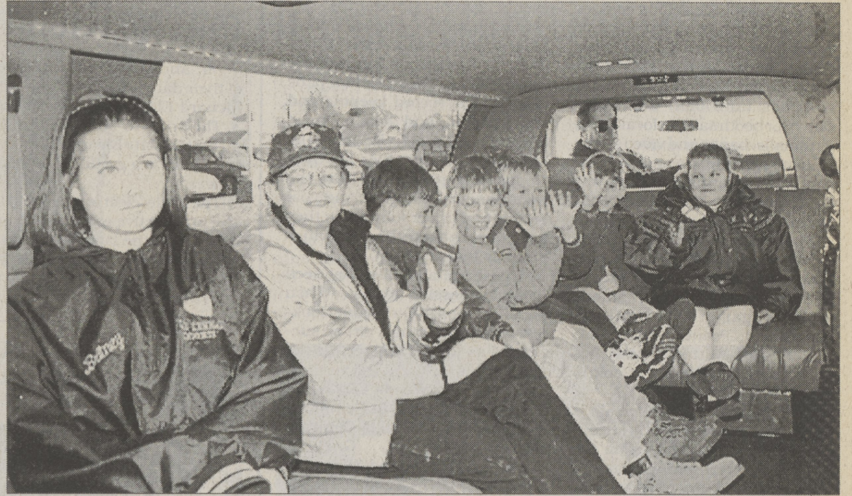
After being picked up at the school, Lehman Jackson Elementary School students were driven to McDonald's in Shavertown for lunch.