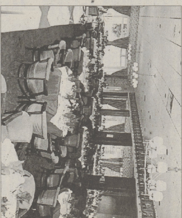
Irem Temple Country Club