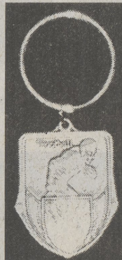
Players received a commemorative medal