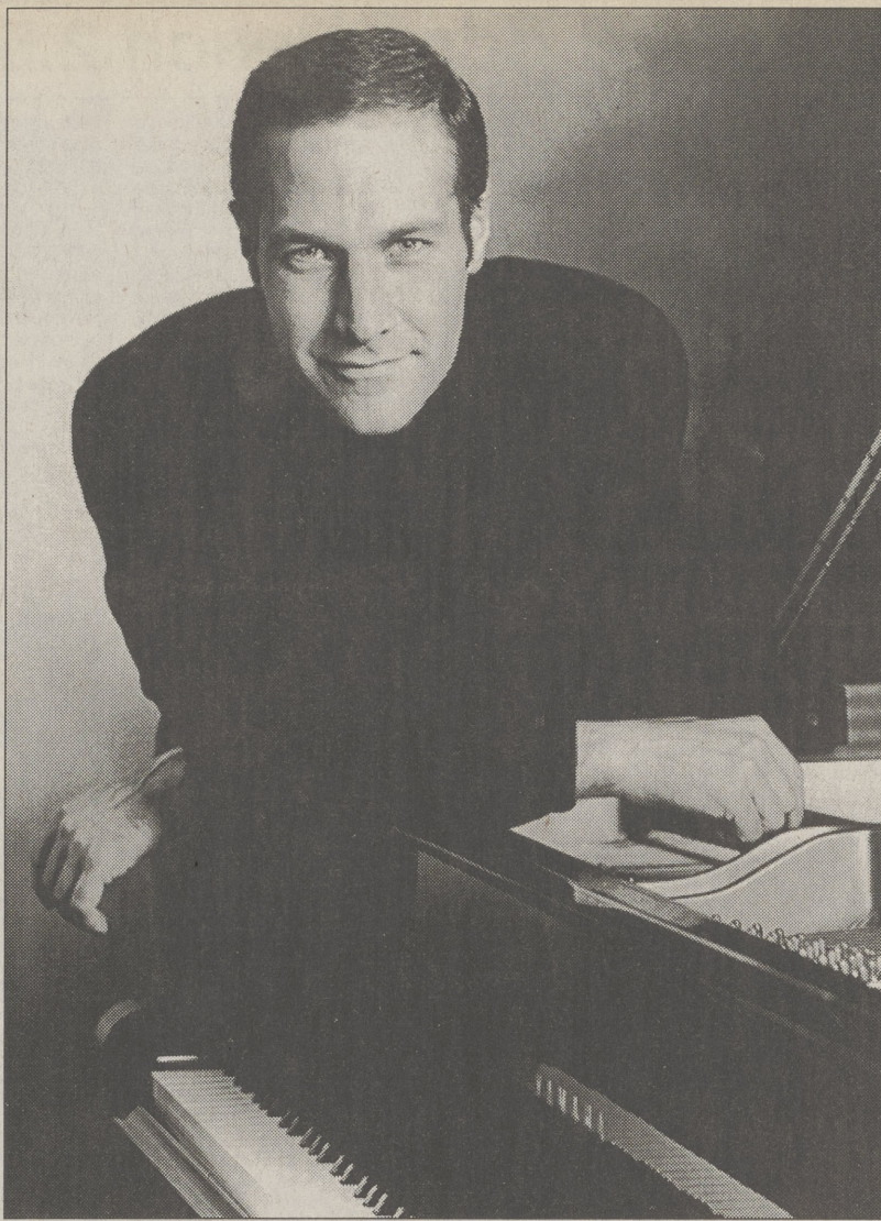
Jim Brickman to play piano at Kirby Center Oct. 19

The composer, pianist and performer whose dreamily romantic piano artistry and high-spirited, witty interaction with audiences have made him one of America's most popular new concert performers brings his unique talents to the stage of the F.M. Kirby Center for the Performing Arts of Sat. Oct. 19 at 8 p.m.