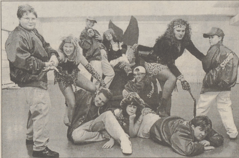
Getting ready for the big night. Stars of 'Starmites' to play Oct. 11 at Wilkes University