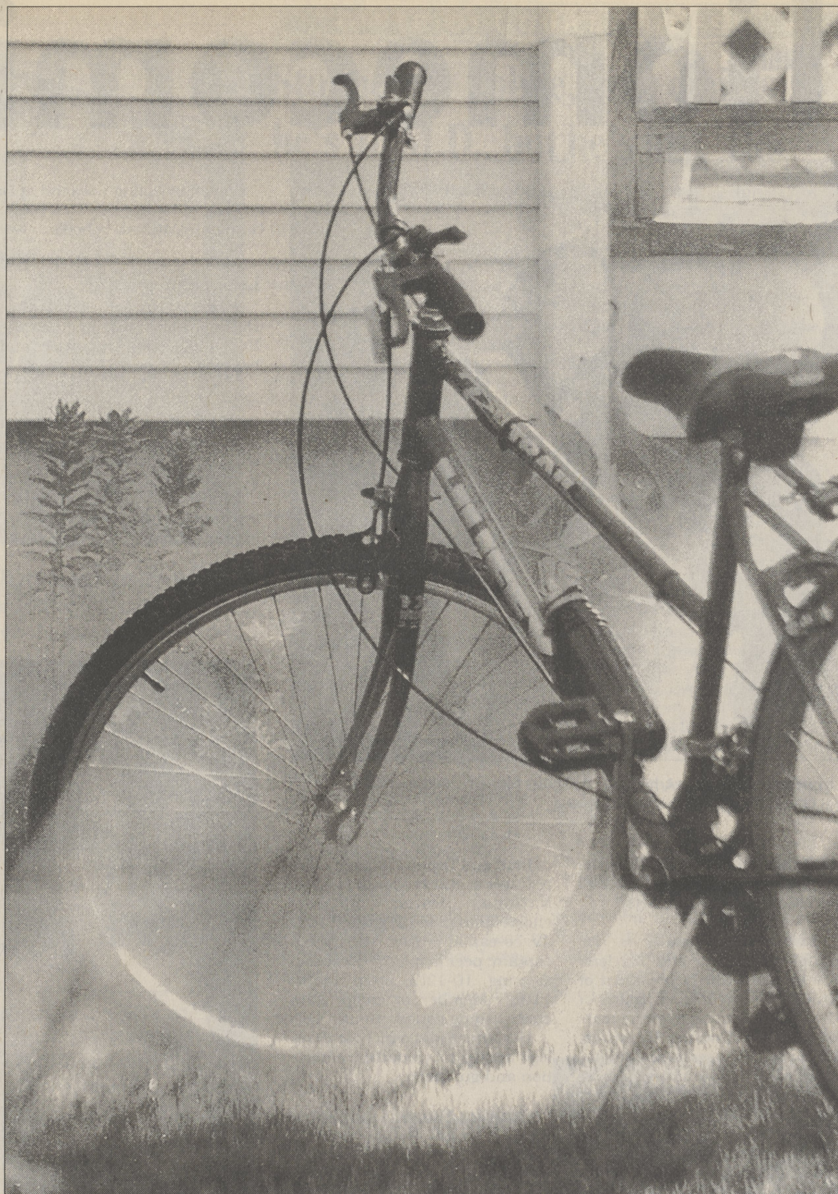
Fading sun on an icon of summer.

Editorials are the opinion of the management of The Dallas Post, and are written by the editor unless otherwise indicated. We welcome your opinion on contemporary issues in the form of letters to the editor. If you don't write, the community may never hear a contrasting point of view. Send or bring letters to: The Dallas Post, 607 Main Rd., Dallas PA 18612. Please include your name, address and a daytime phone number so that we may verify authenticity.