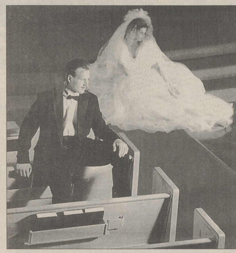
Consider the time of day and the wedding's formality when choosing formal wear for the groom and attendants.

Don't even think about wearing something as boring as a one-button tuxedo. "That's past history," says Kaminow. "Now manufacturers are producing single-breasted models with two-button and as