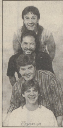
FABULOUS BREAKER BOYS