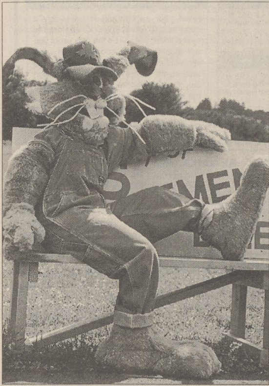
The Luzerne County Hare welcomes one and all to the Fair!