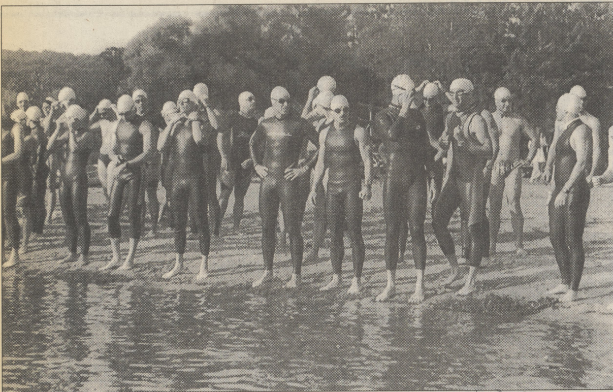
Racers waited for the starting gun at last year's Wilkes-Barre Triathlon.