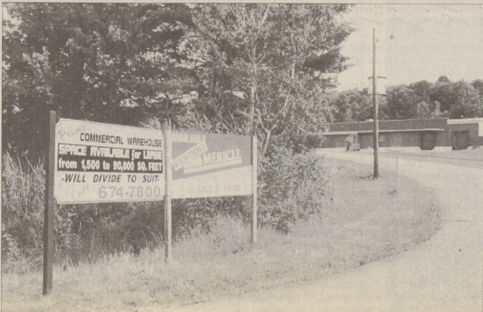
Signs at the entrance of the former Native Textiles building indicate a sale is pending and space is for rent.

■ Family ties Karl and Helen Besteder live in the house their family once rented to Commonwealth Telephone. Pg 5.