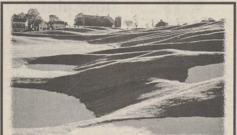
The thirteenth at Huntsville, a 410-yard par 4

Ranked #6 in the U.S.A. in the category of "Design Variety" by Golf Digest Magazine , May 1997 issue.