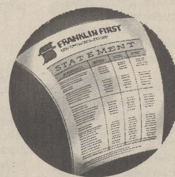
Combined Monthly Statement