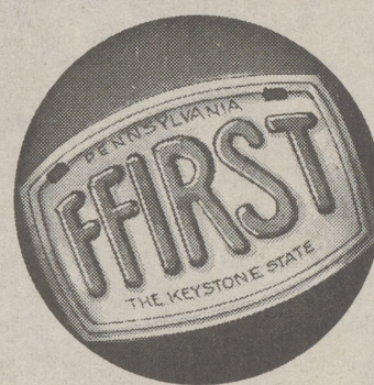
Special Rates on Auto and Personal Loans