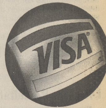
No Annual Fee Visa

Whether You're a Saver, a Borrower... or Both, Get First Class Treatment With My New Franklin First Class Checking.