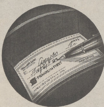
Checking with Interest

Consignments are being accepted this year. For further information about consignments, also call the above phone numbers. When items are consigned, it is the responsibility of the owner to get the item to the Grange Hall. When the item is auctioned, the owner gets 90% of the amount, the Grange gets 10%. This is the first year consignments will be accepted.