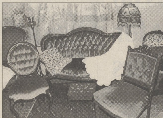
Some of the many antique items that will be sold over the block at the 51st Annual Library Auction.

Any and all donations of cash or saleable items can help assure the continued fine service of the library to our communities. For more information, call the library at 675-1182.