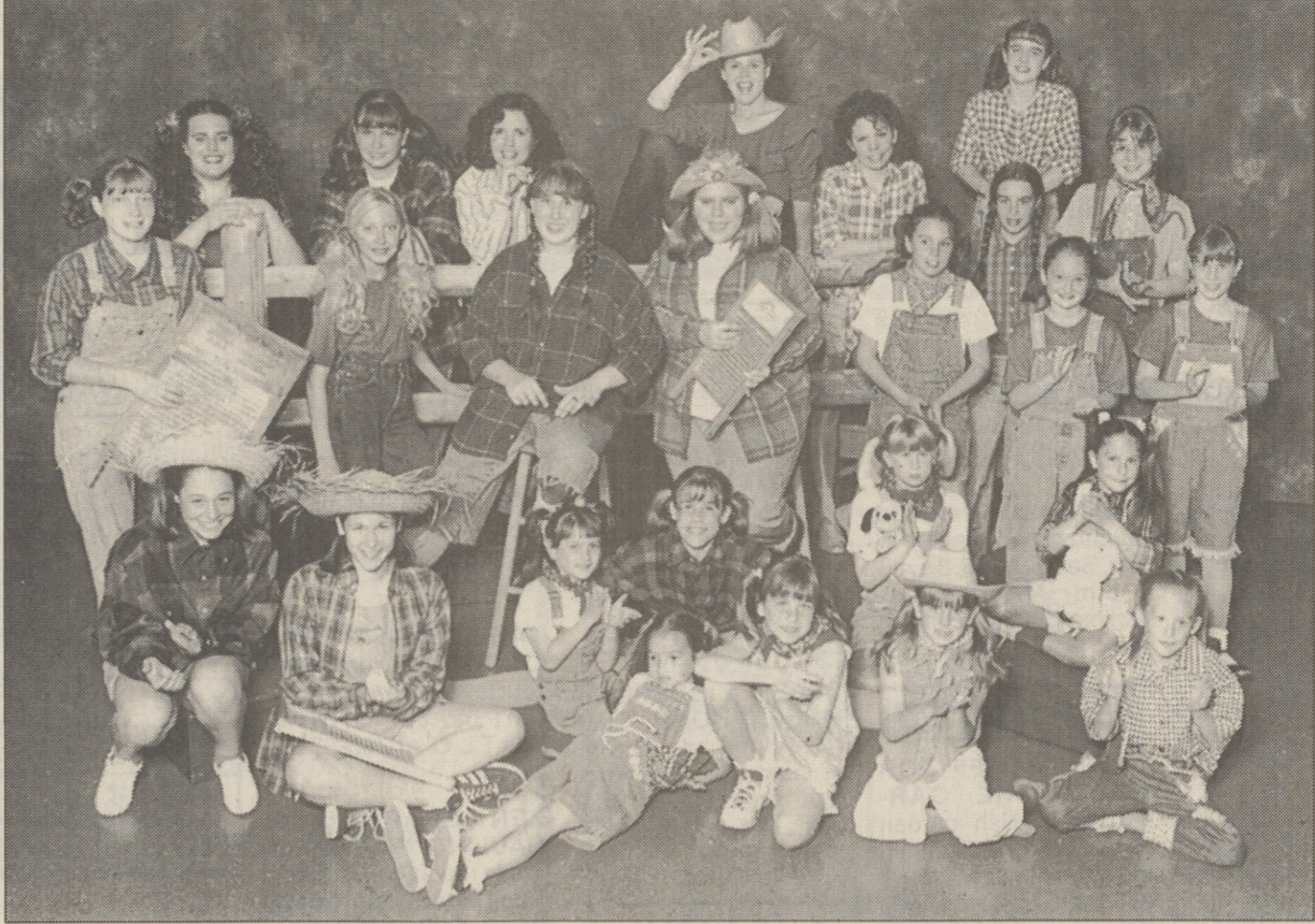
America On-Tour to be performed on June 28 and June 29 at the Darte Center

JUNE 26-29, THE ODD COUPLE. Music Box Playhouse, 196 Hughes St., Swoverville. Thurs., Sat. performances at 8 p.m., cash bar, opens at 6 p.m. buffet served from 6:30; Sun. matinee bar opens at 1:30 p.m. dinner served at 2 p.m. curtain is 3:14 p.m. Dinner/Show $28; show only, $215. Call 283-2195 or 1-800-698-PLAY.