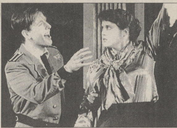
Scene from Othello . Iago and his wife, Emilia, from the National Players' 39th tour production of Shakespeare's Othello .