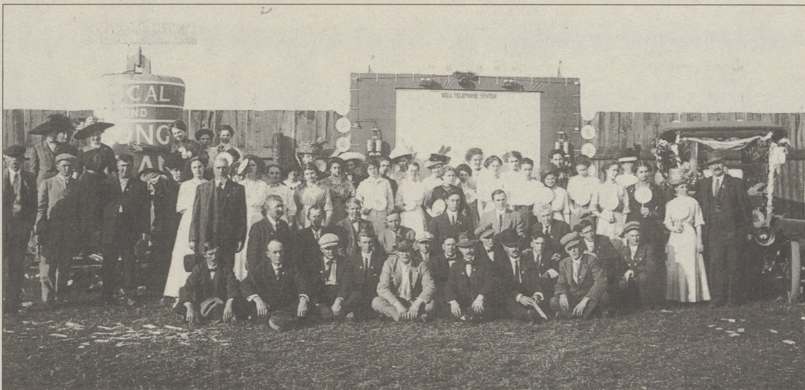
Employees of Commonwealth Telephone enjoyed an outing in Centermoreland in 1912. The company was formed in 1897 in