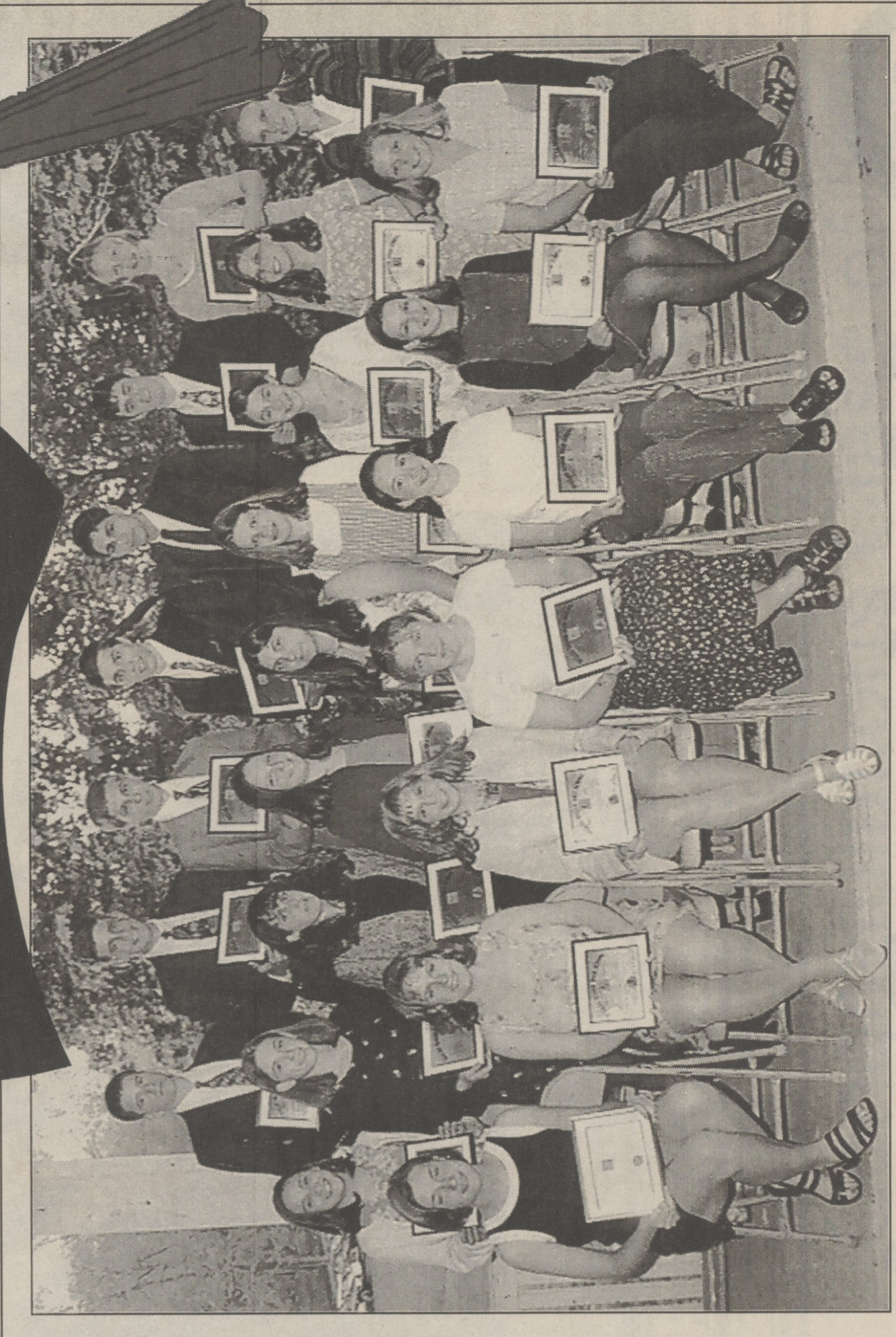
Dallas High School traight A students. Caption on page 2.