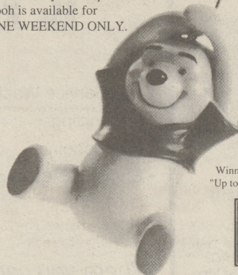
Winnie The Pooh Ornament "Up to the honey tree" 5 1/2" h

FREE "Hunny Pot" keychain with Walt Disney Collectors Society membership.