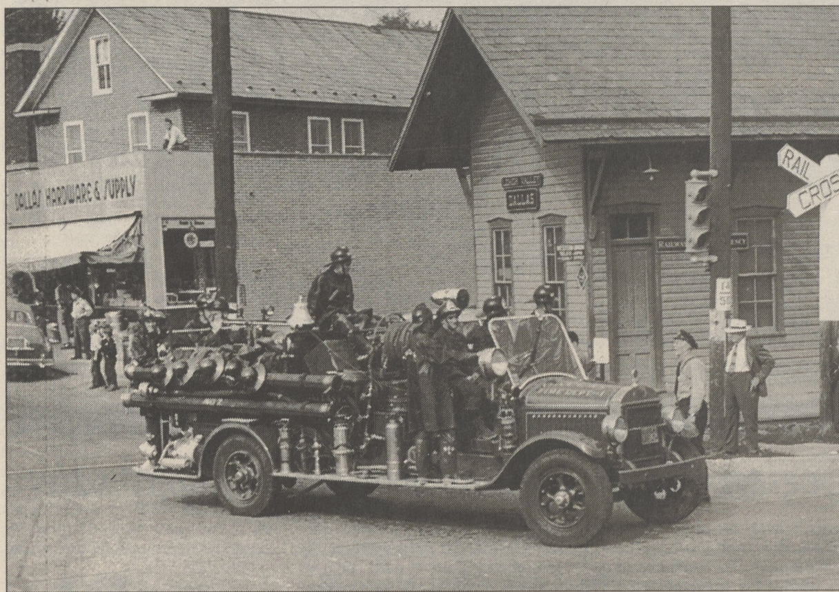
The 1927 Mack firetruck shown at the center of Dallas sometime in the 1940's. The railroad station was on land now owned by the Post Office.