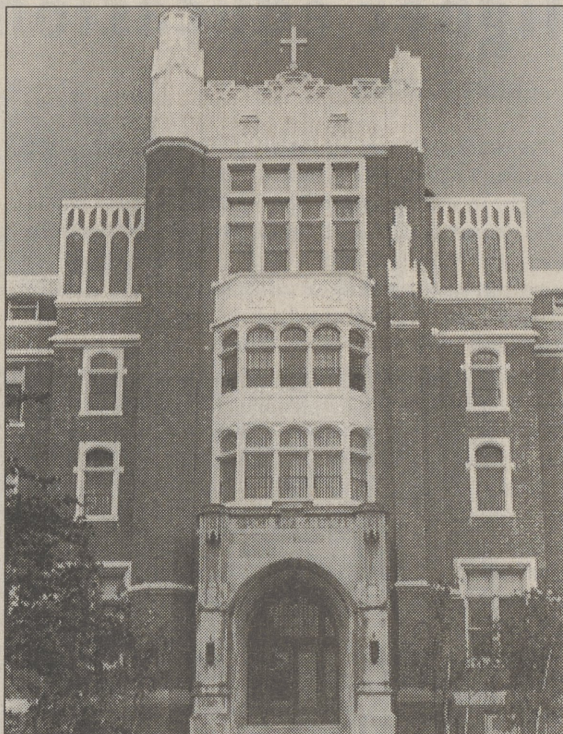
When College Misericordia opened, the center portion of the present administration building housed the entire college.

For information about the campus and its activi-