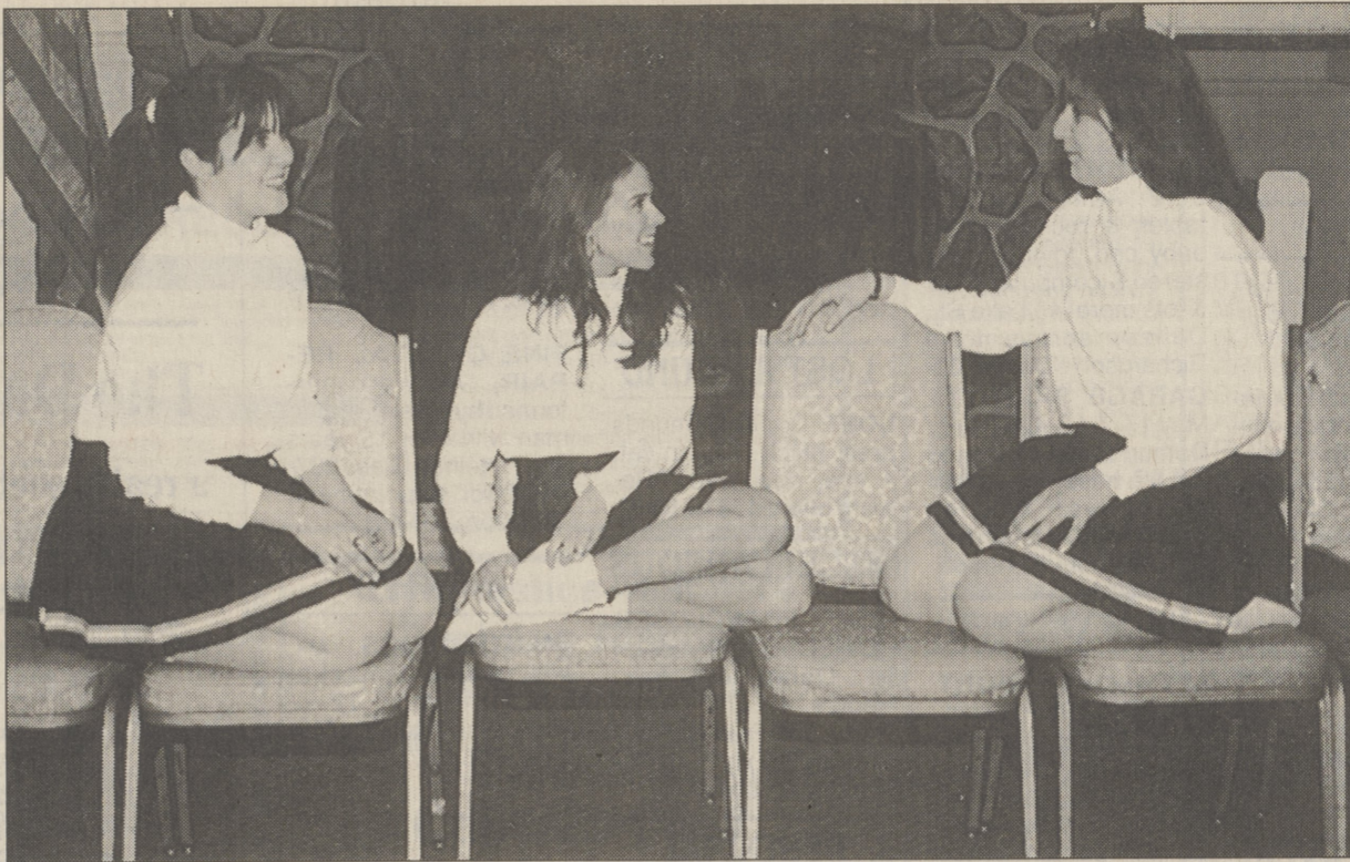
Scene from 'Vainities' to be performed at Castlefondo on May 16 & 17