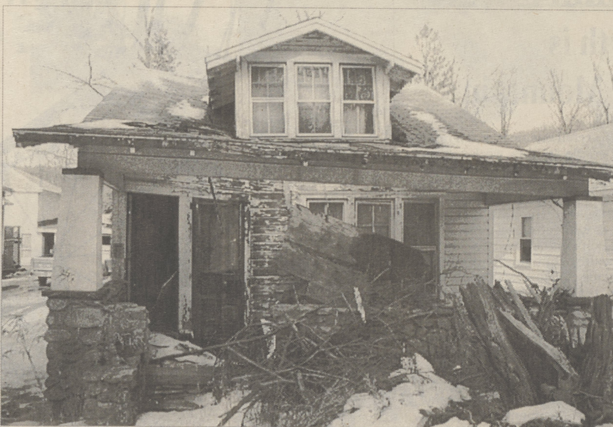
This abandoned house on Old Lake Rd. is one of many the Borough of Harveys Lake would like to tear down. The borough has applied for a county demolition grant of $15,000.