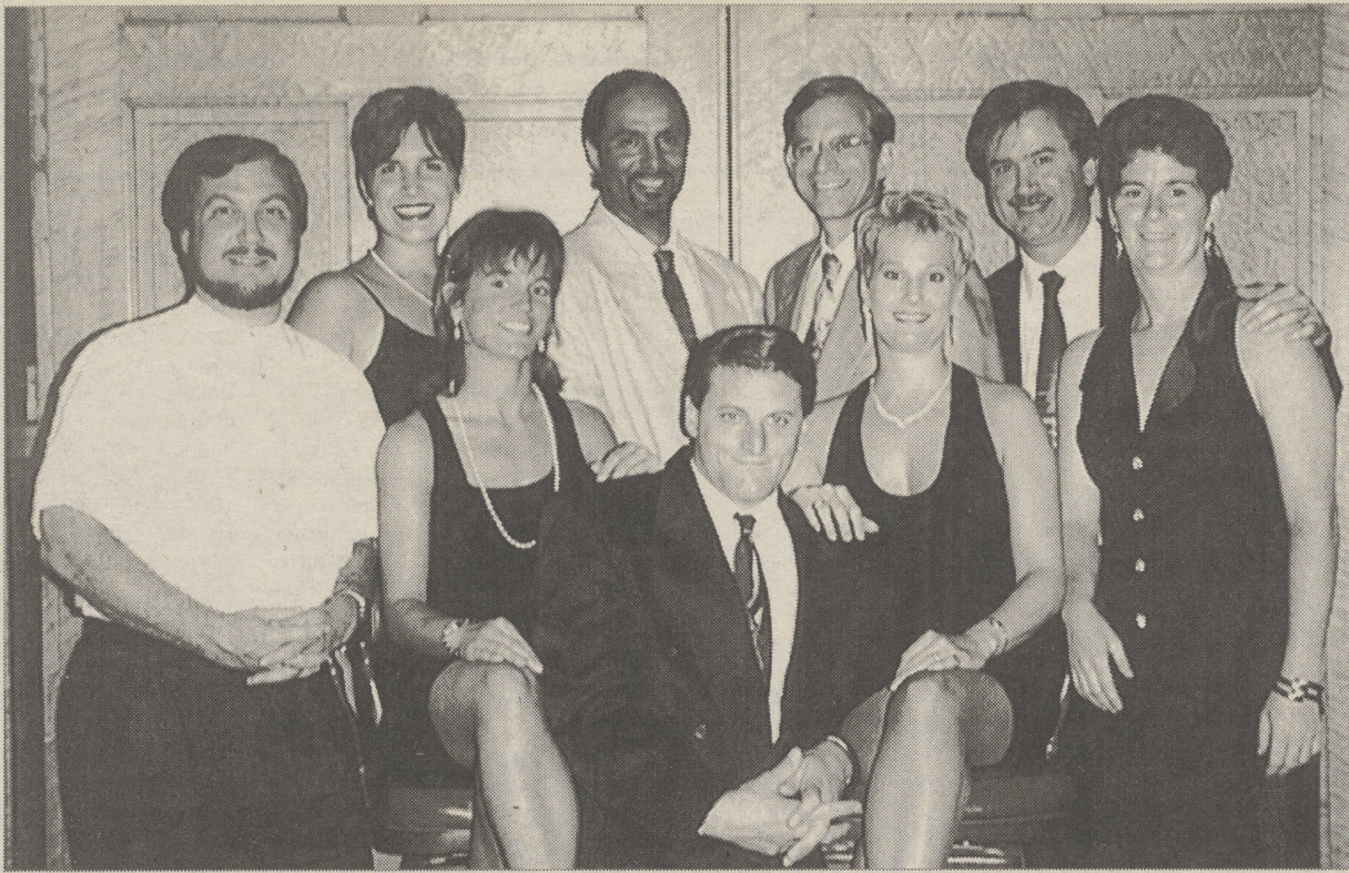
'Which Doctor?' will perform at Genetti's Hotel and Convention Center on March 7