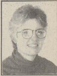
Diane A. Lowe, M.D.

A: Runny nose, coughing and sneezing are common components to these illnesses. A cold usually starts with a clear nasal drainage and a scratchy throat. Over the next week it progresses through a stage of nasal congestion and thicker drainage. It should clear without any treatment in 7-10 days. Allergies involve clear nasal drainage and may also include itchy and watery eyes and wheezing. They do not change over the course of time, except to become better or worse. Either allergies or colds may progress to a sinus infection. When this occurs, the nasal drainage will remain for a prolonged period. Headaches around the eyes are prominent. There may be a fever. Sinus infections require antibiotic treatment, so see your doctor if you suspect one.