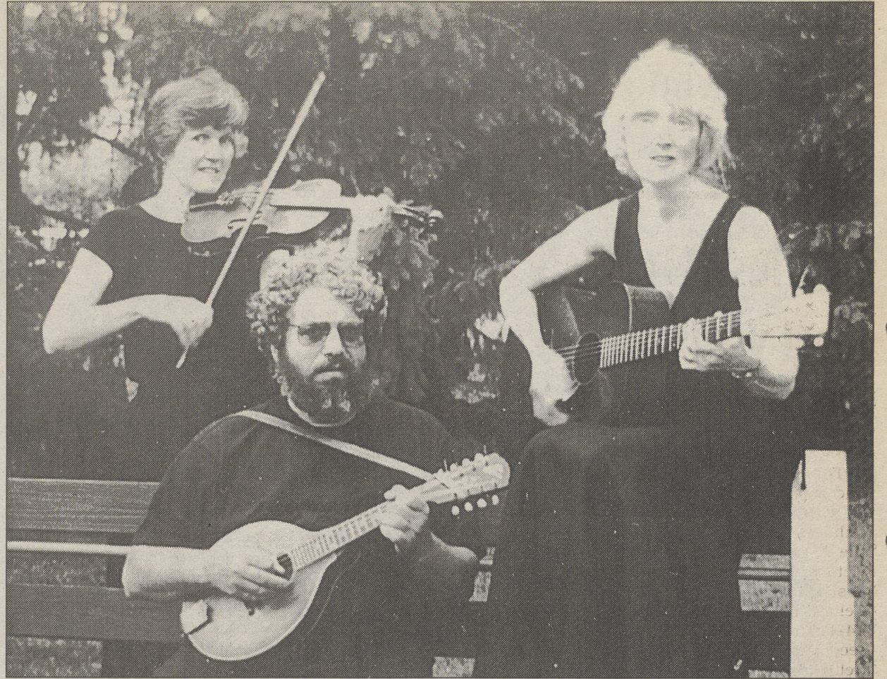
Hotfoot! will kick off the contra dance series sponsored by the Chicory House and the Folklore Society. They will appear Jan. 11.

Admission is $6 for adults, $3 for children and $15 for families. Dancers are asked to bring a plate of refreshments to share at intermission. For information, call 333-4007.