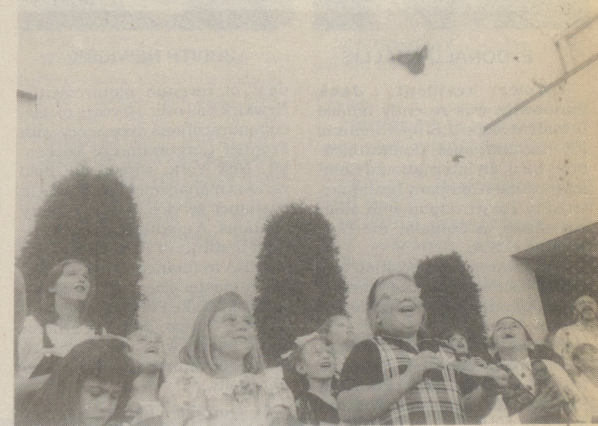
Children released monarch butterflies at the official kickoff of the fund drive for a new children's wing at the Back Mountain Memorial Library.