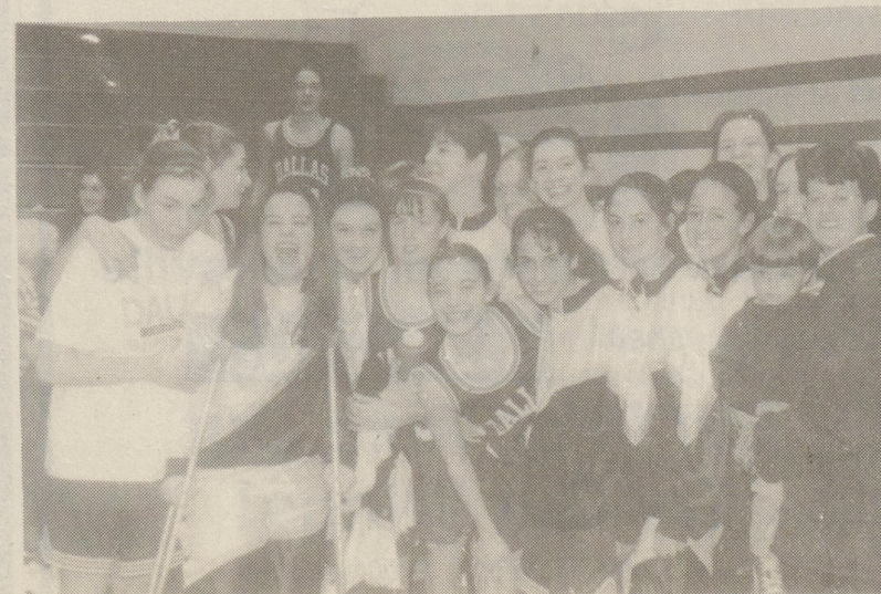
The Dallas girls' basketball team went to the post season for the first time, and won their first round game.