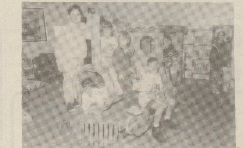
Students helped dedicate the "Lolly Larkins Reading Corner" at Lake-Noxen School.

May 22: Lake-Noxen school officials dedicated the "Lolly Larkins Reading Corner," to honor the beloved teacher who died in 1995 after a long battle with cancer.