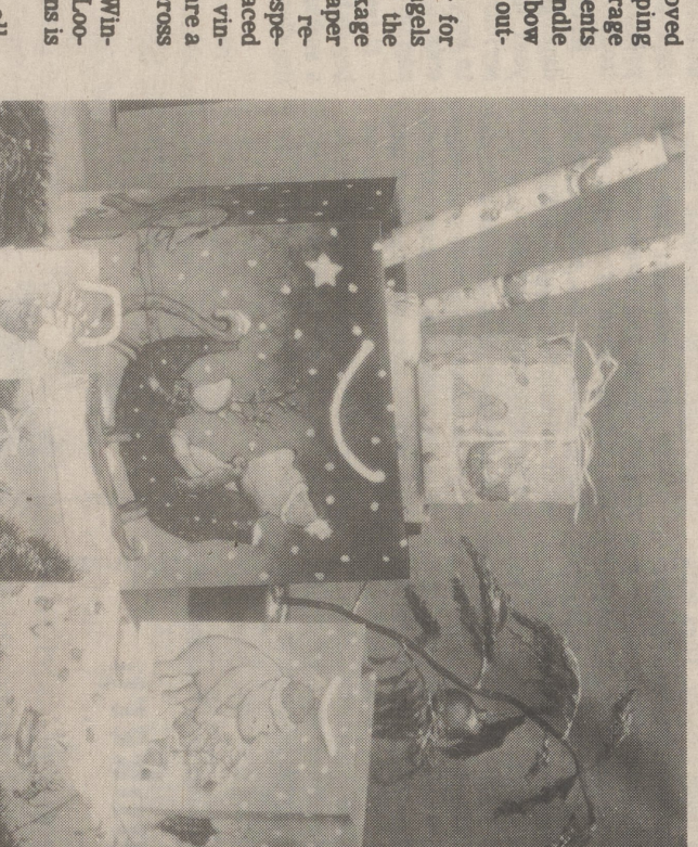
Holiday theme Winnie-the-Pooh gift bags wrap and wrap will turn up under lots of trees this holiday season.

pecial gift (such as jewelry). Mix and match. Wrap lids and sult in the smallest box is a really