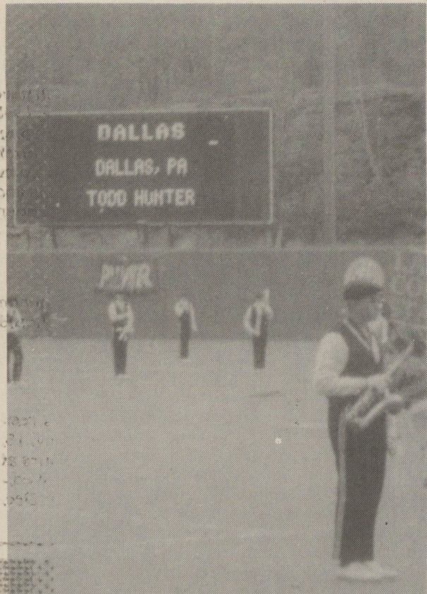
Members of the Dallas Marching Band performed as the band's title lit up the sign at Lackawanna County Stadium.