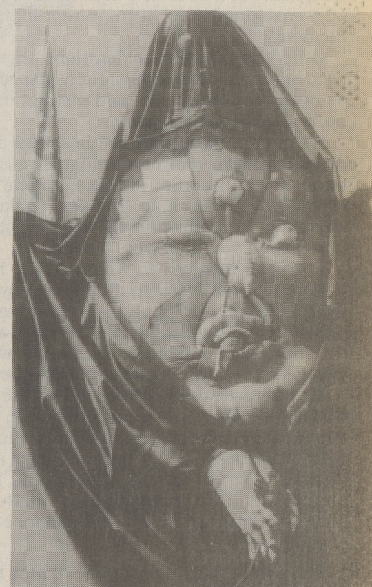
UGLIEST: Tanya Siglin