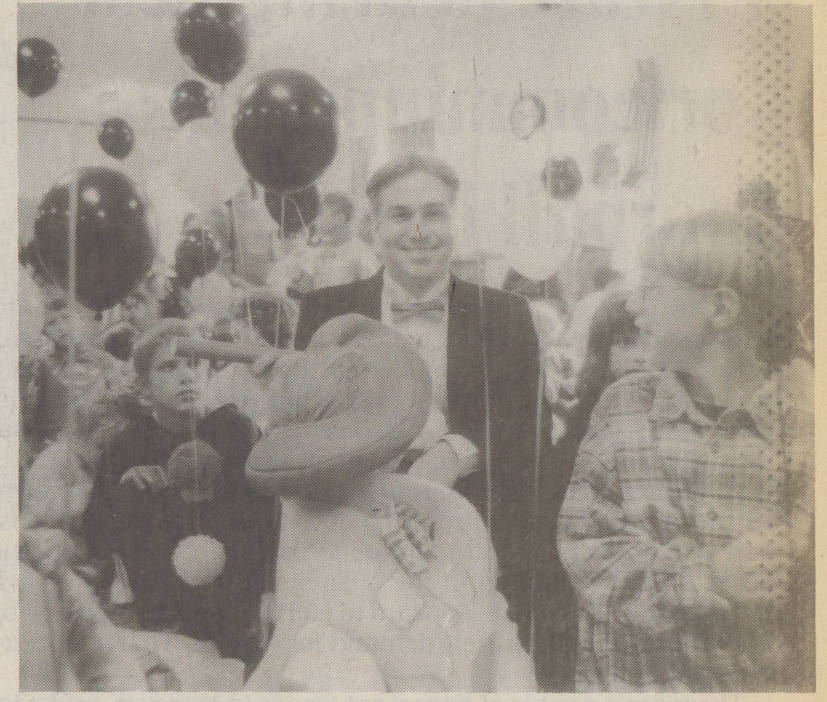
After the parade, everyone enjoyed a party and refreshments sponsored by the Back Mountain Business and Professional