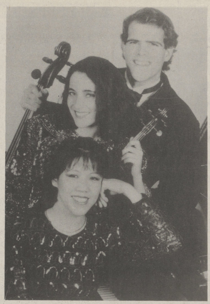
The Guild Trio will appear at College Misericordia Nov. 5