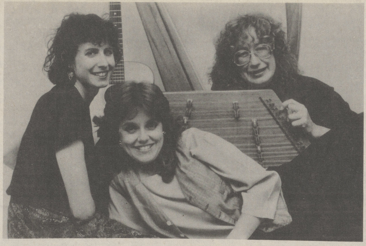
Ceoltoiri will appear at the Chicory House Oct. 25

HARVEYS LAKE CRIME WATCH ASS'N. meets the last Wednesday of every month at the borough hall, 7 p.m. For more information call the borough office at 639-2113.