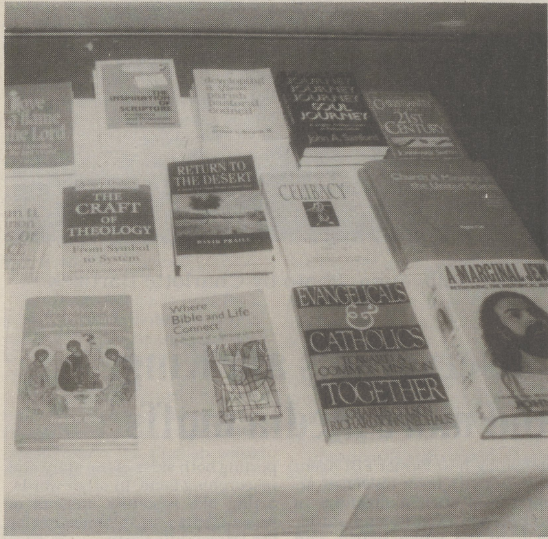
A wide array of literature was available for purchase, including works by many of the presenters.

Perhaps you can't see it from Lake Street, but it's all there just the same!