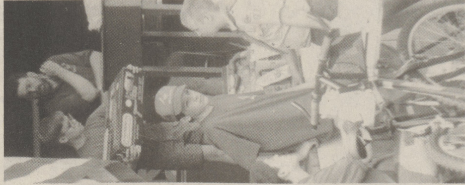
Boy Scouts from Troop 281 put on the children's auction Saturday morning.