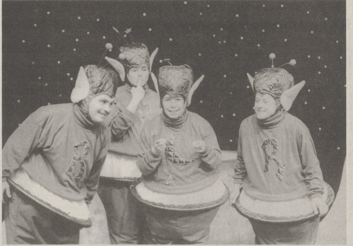
Moon People Snap, Crackle, Pop and Nice 'n' Crispie , shown here in the 1992 production of the original kids' musical Shoot for the Moon , will return to the Music Box Dinner Theatre March 15-17 and 22-24.

The Music Box Dinner Playhouse is located directly off of Wyoming Avenue (Route 11).