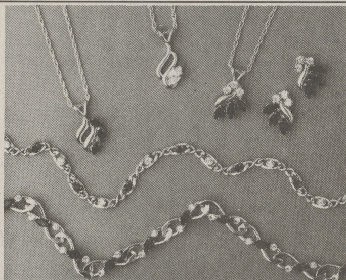
14kt. gold overlay pendants, earrings and bracelets from $32.50