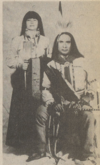
An evening of traditional Native American legends, dances and songs and African music will be presented Feb. 5 at College Misericordia at 8 p.m. as part of the college's cultural events programs.