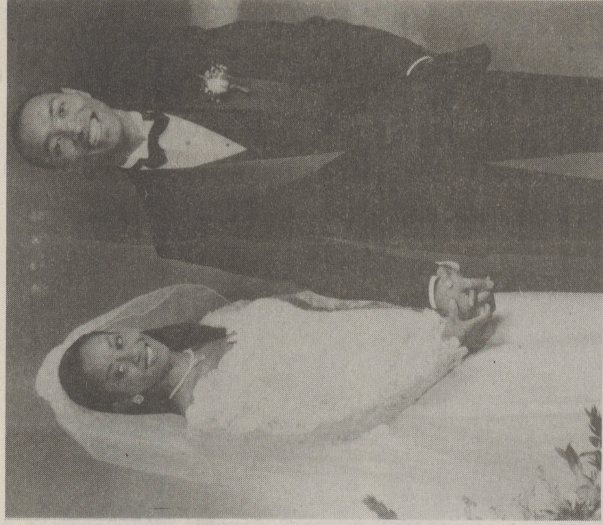
Many grooms are choosing simple black tuxedos with satin shawl collars to complement their bride's elegant gowns.

For the more conservative, the company shows richly patterned black on black brocades and vests with satin lapels to coordinate with