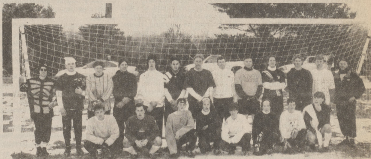
Members of the Dallas High School soccer team met alumni in a game just after Thanksgiving. The alumni pulled out a 4-3 win in two overtimes.