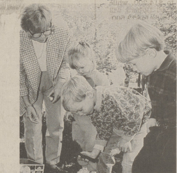
Dedicated teachers encourage individual achievement.

AT WYOMING SEMINARY'S LOWER SCHOOL, students in pre-kindergarten through eighth grade prepare for a lifetime of learning. With an average class size of 12, individual attention is the key to academic success. Students learn at their own pace; extra challenges and extra help are provided for students of varying abilities.