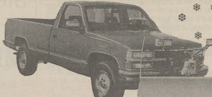
1995 CHEVROLET HEAVY DUTY 2500 3/4 TON 4X4 PICKUP w/SNOWPLOW

Stk. #60082, 1.6L SOHC 16 Valve L4 MPI Engine, 5-Speed, Dual Airbags, ABS Brakes, Automatic Daytime Running Lamps, Delay Wipers, Stainless Steel Exhaust