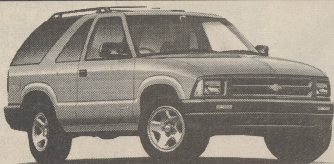
1996 CHEVROLET BLAZER 15 2 DOOR 4WD

You'll find it nice to know that the Blazer Drive Control System is there to give you a confident sense of control on any road, whatever the driving conditions. Stk. #60112, 4-Speed Automatic w/OD, Airbag, Air Conditioning, AM/FM Cassette, Tilt, Cruise, Power Windows/Locks, ABS Brakes, Towing Suspension Package, Electronic Shift Transfer Case, P235/70R15 Blackwall Tires, Outside Spare Wheel and Tire Carrier.