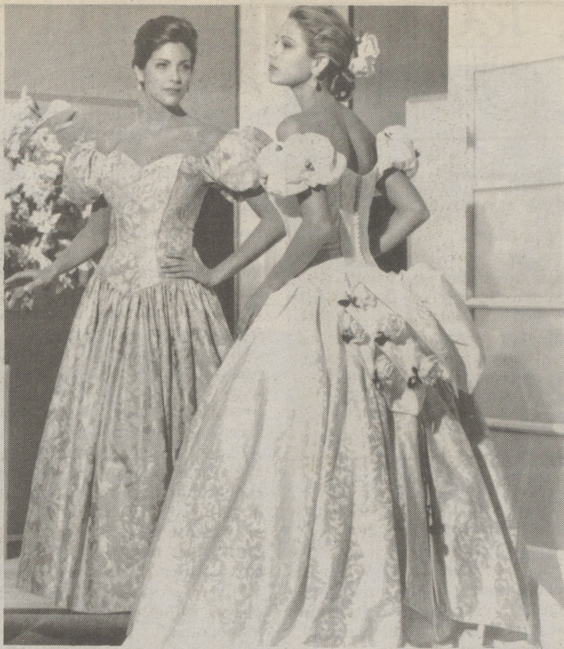
The bricade fabric and romantic cut of this bridesmaid's dress reflect details of the bride's gown.

• Thinking you have to spend every minute together. It's a good idea to spend a little time apart on your honeymoon so that you don't get on each other's nerves. You'll both be happier if you plan to do a couple of activities on your own.