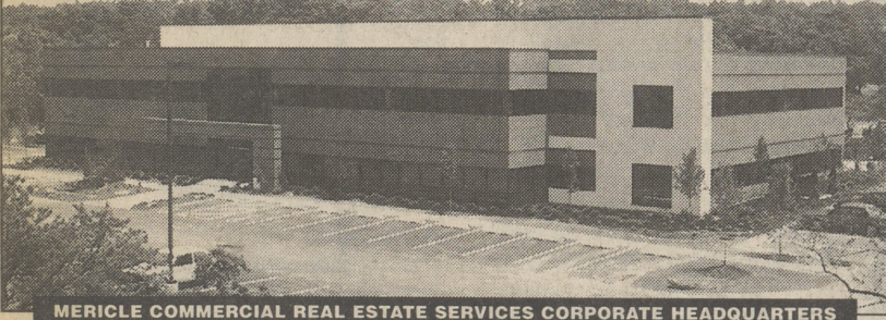
MERICLE COMMERCIAL REAL ESTATE SERVICES CORPORATE HEADQUARTERS

Corporate Headquarters, East Mountain Corporate Center 600 Baltimore Drive, Wilkes-Barre, Pennsylvania 18702 717-823-1100 • Fax: 717-823-8005