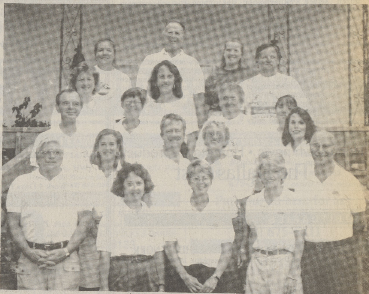
Wilkes-Barre Triathlon volunteers make it happen

No paper has as much Back Mountain news as The Post