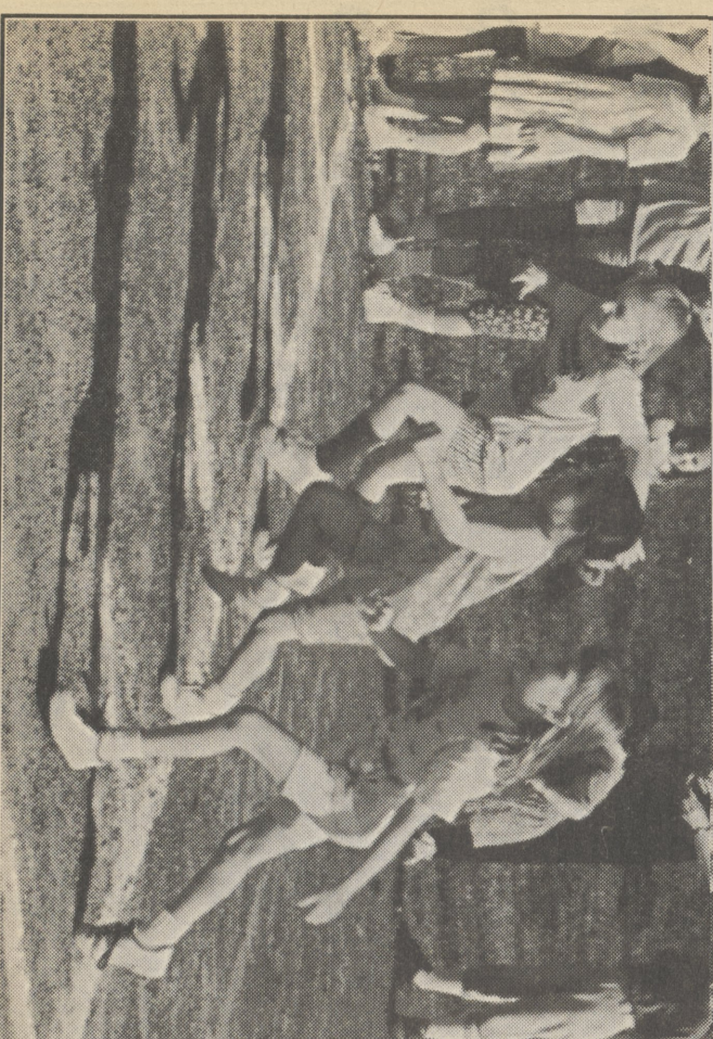
120 Girl Scouts from the Dallas area enjoyed an afternoon of fun in the sun at a Girl Scout Field Day held at the Dallas Middle School Track. They ran races, had a tug-of-war, ball toss, and learned the right way to stretch to prepare for all these activities.

January 5, 6, 7, 1996 will see up to 42 girls enjoying a "Winter Holiday Weekend" at Camp Louise. This will be a fun time with sledding, ice skating, snow-ball fights, whatever the weather will allow. The girls will stay in Hemlock House and Wise Lodge and the $25.00 cost will cover food, lodging, staff and program supplies. The registration deadline will be December 1 and there must be a minimum of 21 participants to have this weekend happen.