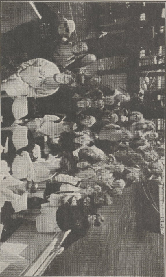
Sixty-eight Cadette and Senior Girl Scouts from all around the Council had a great trip to Cape May, New Jersey on May 19 and 20. They toured historic Cape May and went on a Dolphin Watch, and enjoyed every minute. The group is shown above on the boat, ready to go and look for dolphins.