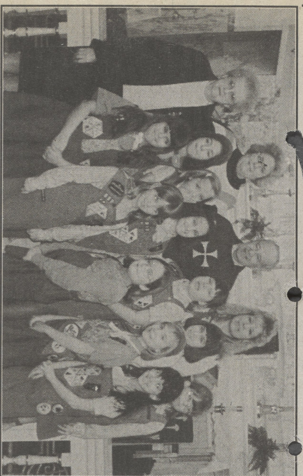
Girl Scout Troops of the Glen Lyon area celebrated Girl Scout Week by attending mass at St. Adalbert's Church, Glen Lyon. Thirteen third grade Brownies from Troop 917 received the Catholic Religious Award, the Family of God medal.