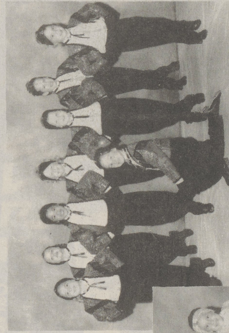
RED HOT N.E. Talent Championships Master Champion Group 1995