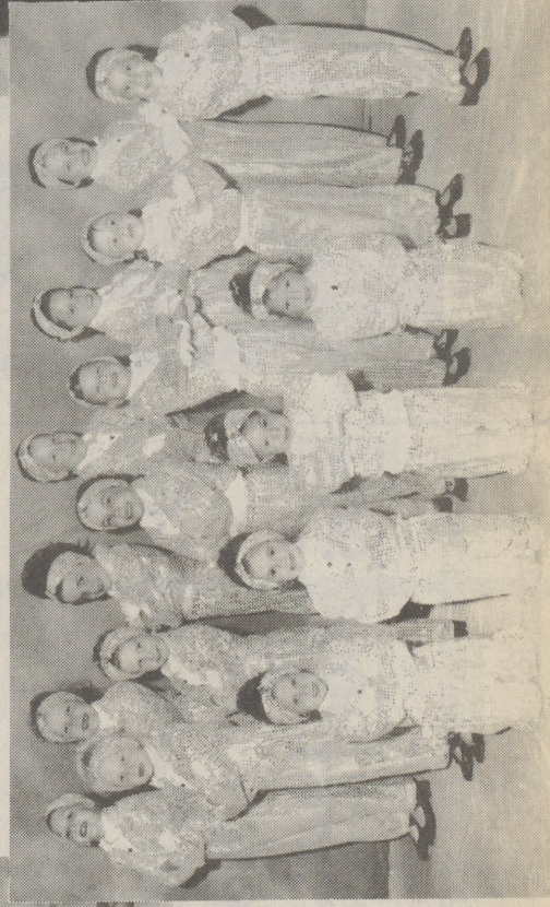
HONEY "EPA Best Overall Line", April 1995