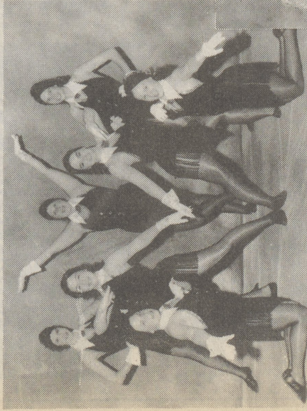
SHOWSTOPPERS Hazleton FunFest Super Group Award 1995