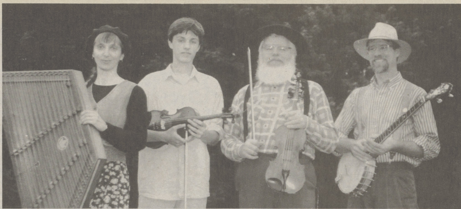
The Back Mountain Reelers, a group of area musicians dedicated to preserving line dancing New England style, will perform at the Arts at Hayfield Summer Festival August 27. The festival is held at the Penn State campus in Lehman.