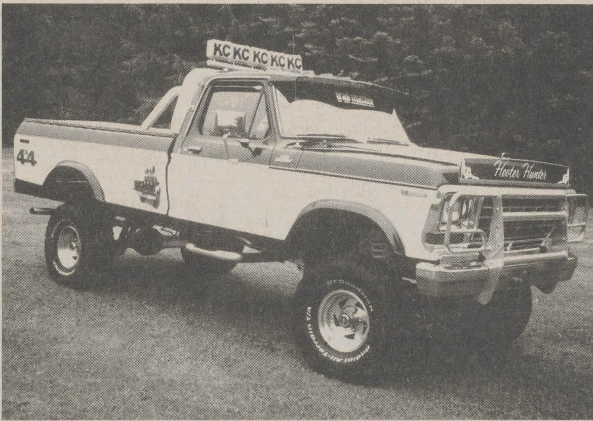
Tim Cobleigh's custom restored 1978 Ford F150 Explorer will be among the cars and trucks displayed at the Lehman show. The truck is a frame-up restoration with a completely new body, and features a 351 V-8 engine, C-6 auto. trans. and 4.10 positraction rear axle. The truck has garnered eight 3rd-place trophies and three, 2nd places in previous shows.