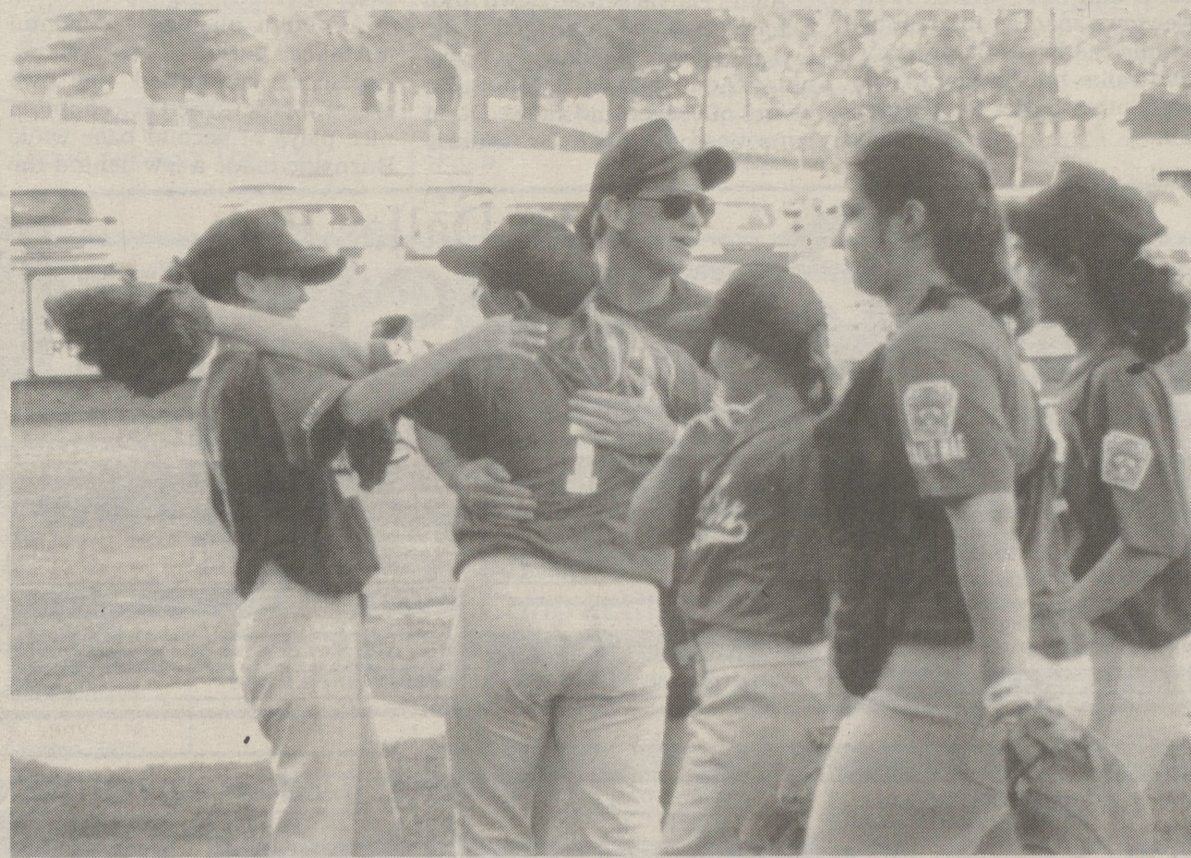
Red Sox players and coaches celebrated their Major League Softball championship after last week's 6-1 victory over the Dodgers, above.